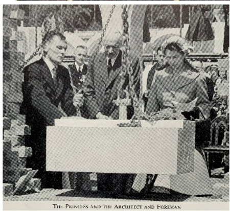
THE PRINCESS AND THE ARCHITECT AND FOREMAN