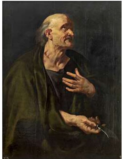
St Bartholomew by Rubens c. 1611