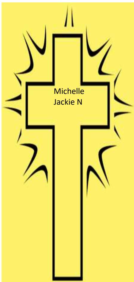
St John's Prayer Cross