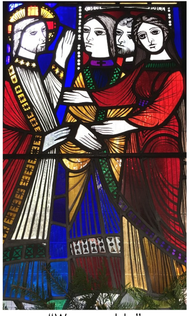
"We are able"

Pews News & Service Sheet for Sunday 25th July 2021