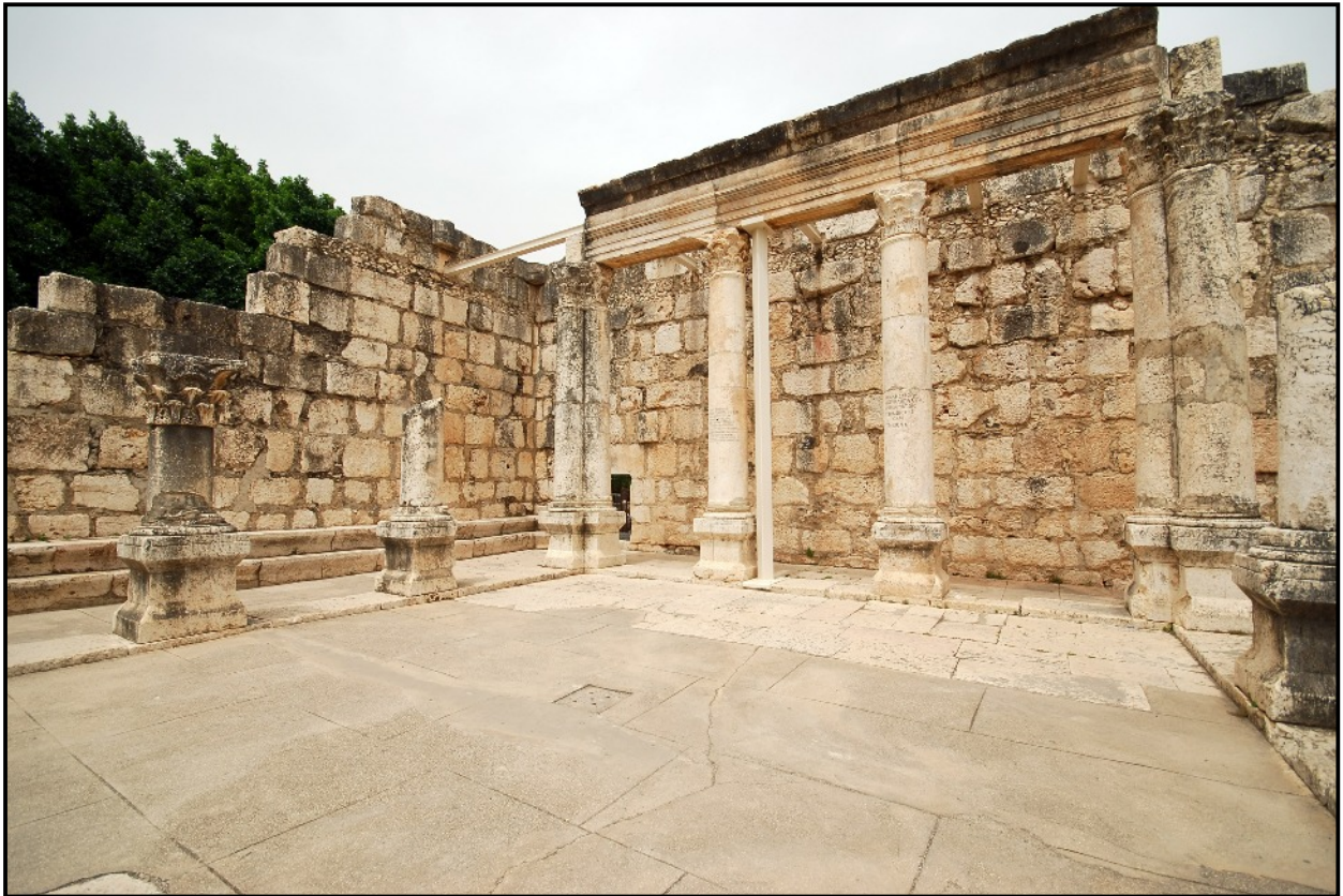
Ancient synagogue ruins, Capernaum, Israel