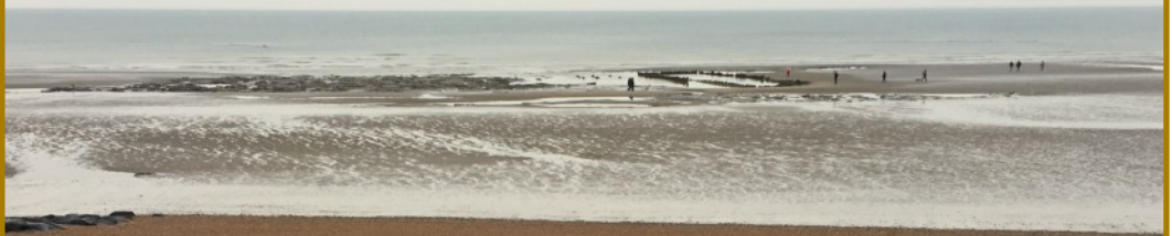
Very low tide at Bulverhythe, Mar. 2019