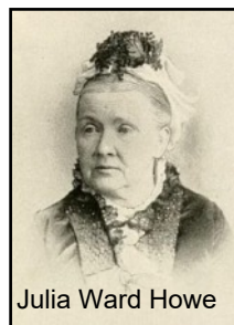
Julia Ward Howe

As Johnny Cash said in 1969, "The Battle Hymn of the Republic is an anthem that belongs to everybody. But what really matters is what they're singing it for."