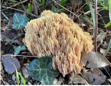
The fungus Ramaria stricta , "Straight-branched Coral"