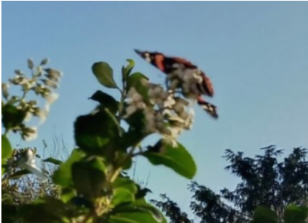
A bedraggled Red Admiral butterfly, laying its eggs.