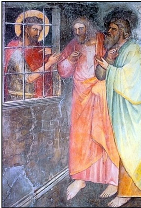
John the Baptist in Prison by Giousto de Menabuoi (1320–1391)

Pews News & Service Sheet for Sunday 11th December 2022