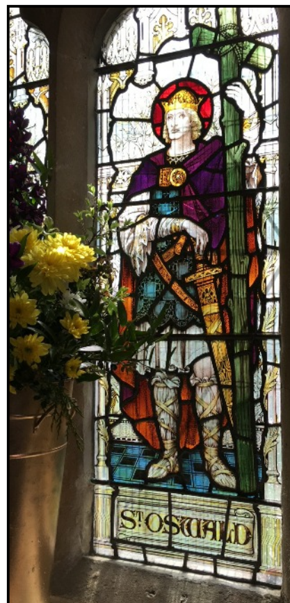
St Oswald, as depicted in stained glass in St Helen's Church, Ore

Keen on pilgrimages? One can walk the 'Saint Oswald's Way' from Heavenfield to Holy Island, as shown in red on this map