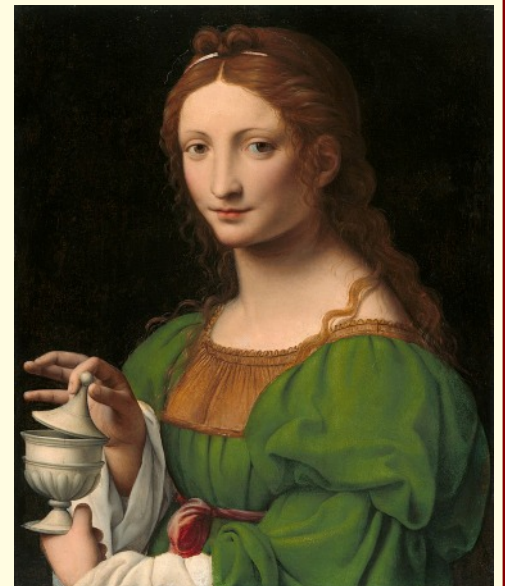
'The Magdalen' - Bernardino Luini (1475–1532)

Whatever the details of Mary's story, we cherish it because it shows that having a 'past' is no reason not to have a future.