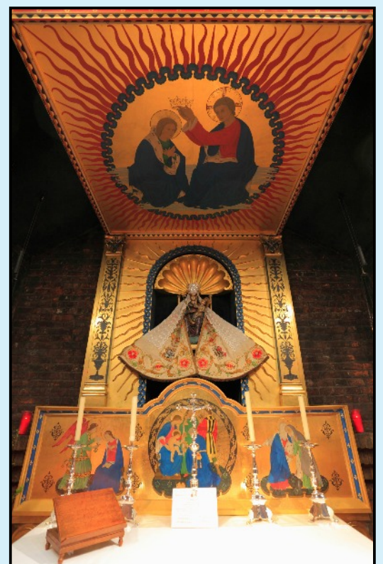
Inside the Anglican Shrine at Walsingham

Principal Marian shrines of today include Lourdes (France), Fatima (Portugal), Walsingham (England), Loreto (Italy), Czesochowa (Poland) and Guadalupe (Mexico).