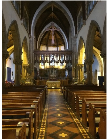
The lovely mellow interior of St Andrew's Cathedral, Inverness

The results of their response were in this case life-changing - for themselves, and for many other people. Andrew brought his brother, Peter, to Jesus. The next day Jesus met Philip and called him to 'follow'. Philip then brought Nathaniel. The little apostolic band who would carry the message of Jesus to the whole world was being formed. They came, they saw, they were conquered! And right at the front of the column, as it were, was Andrew, the first disciple of Jesus.