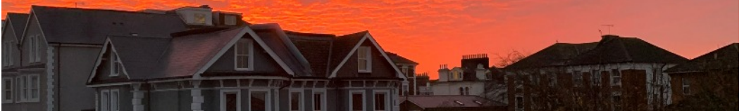
Sunrise over Chapel Park Road, Nov. 2020

The soul that walks in love neither tires others nor grows tired