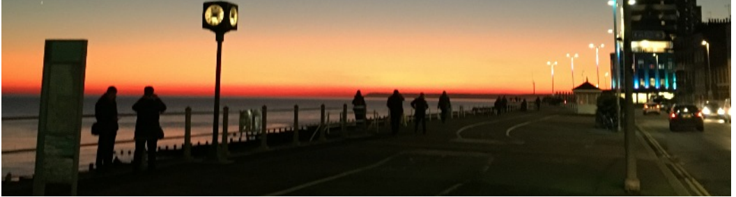
Sunset at St Leonards, Dec. 2019

In the dark night of the soul, bright flows the river of God