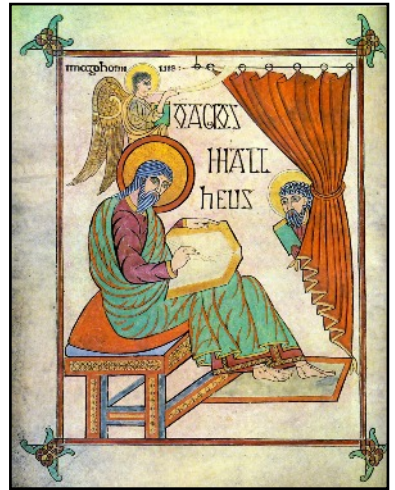
St Matthew, as depicted in the Lindisfarne Gospels

Matthew was martyred by a sword or a spear, some think in Ethiopia.